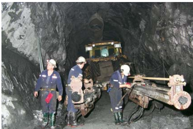
Miners working with the underground jumbo drilling machine.