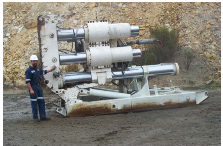
The raise drill rig weighs approximately 32 and tonnes and will be positioned 340m underground

Bendigo Mining is currently developing a 260m deep shaft underground near the corner of Thistle and Deborah Streets. This shaft will be used in the ventilation system of the mine and will be sunk from the decline at 340m below surface to a depth of 600m. Raise Bore Australia has the contract to construct the shaft and equipment for the job is presently being taken underground. The work is expected to take approximately 2 months.