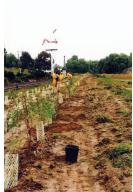
Above: tree planting and rehabilitation work in 1997, along the Eaglehawk railway line near Peg Leg Rd.

Today, Marilyn's work with the environmental team involves an annual program of seed collection (which goes on regardless of any planned revegetation work), identification and earmarking of suitable areas to be rehabilitated, and direct seeding and planting. Seed is collected over summer and planting