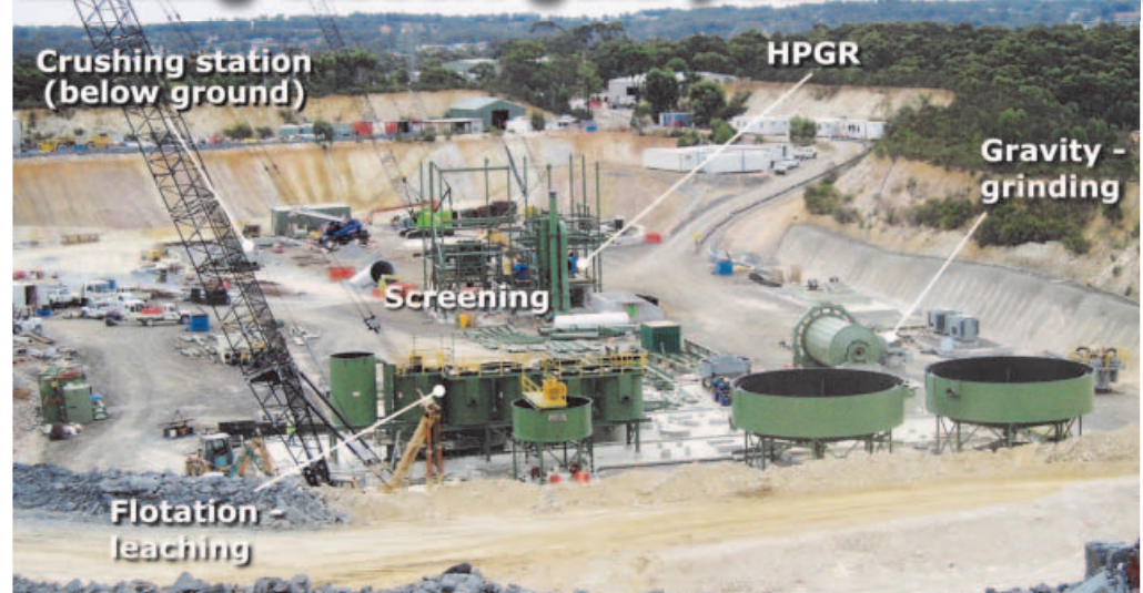
Above: the processing plant site.