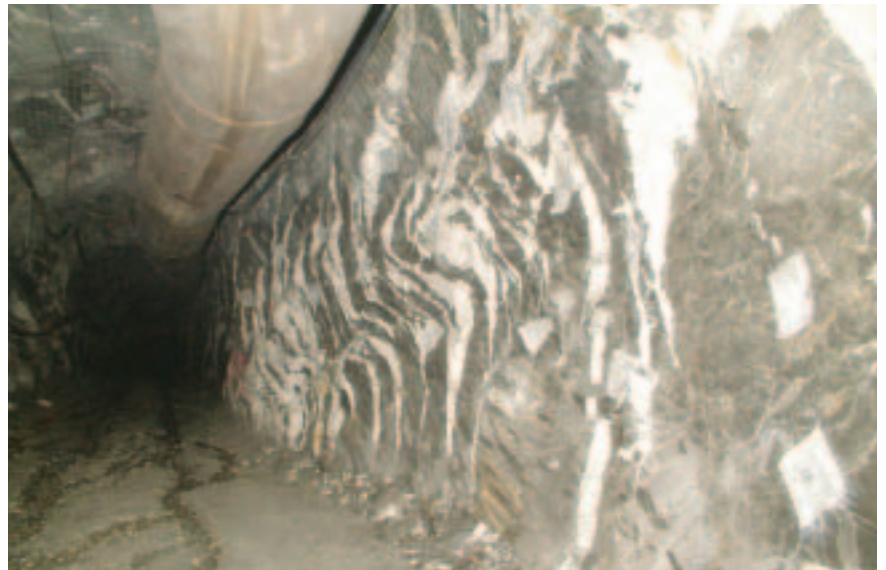
Above: the existing Christine reef, and (below) a diagram outlining the location of the Alexandria reef.

Employee numbers at the mine continue to climb and are now 140-plus, rising by 100 in the last 12 months. Recent additions to the team include four emergency response trainees (see story), while the Macmahon underground team has taken on 14 newcomers since May. Truck drivers, jumbo and bogger operators, offsidars and fitters are among the new staff. Apprenticeships were also advertised recently in the Bendigo Advertiser.