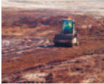
Hard at work: a roller compacts the base of one of the ponds.

Recent rain has been a godsend to farmers, but has resulted in delays to improvements and construction work at the Woodvale ponds with machinery stranded in the wet conditions.